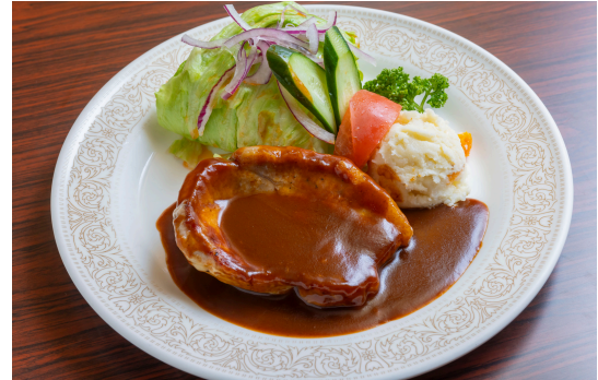
Pork chop ¥ 1,870