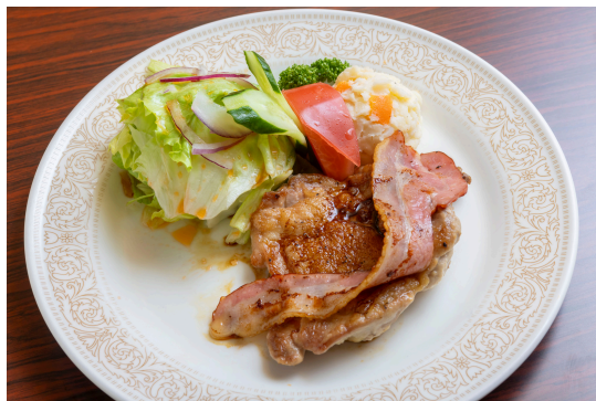
Grilled Chicken ¥ 1,650