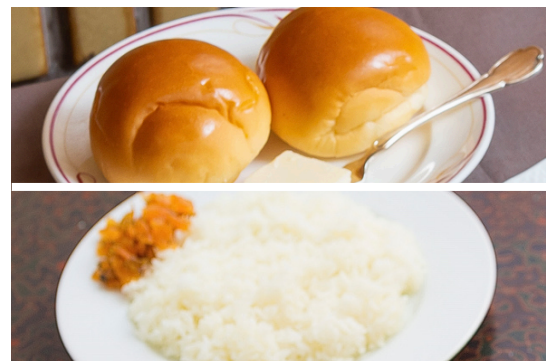
Rice or Bread ¥ 330