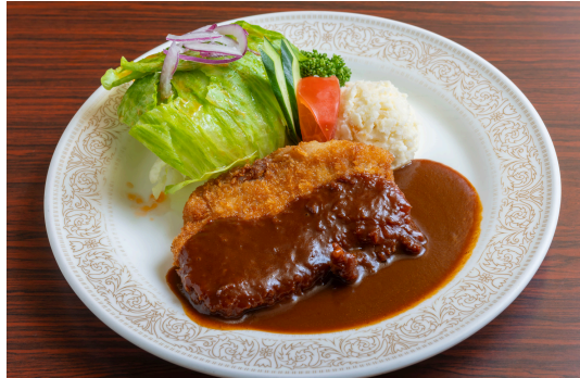
Pork Cutlet ¥ 1,870