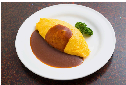
Beef Omelette Rice ¥ 1,430